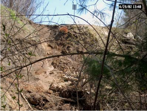
North Ravine Before & After