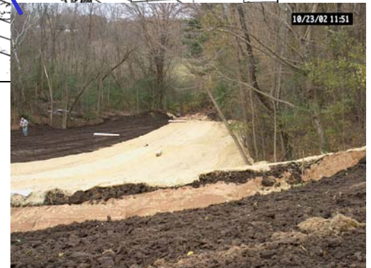
South Ravine Before & After